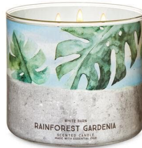
Three wick candle Bath and Body Works, $24.50