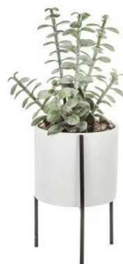
Donkey Tail in white pot Hobby Lobby $17.99