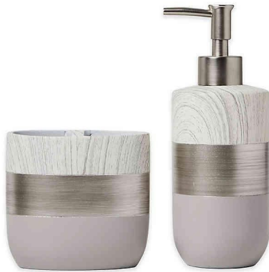
Liselotte Bath Ensemble from Bed, Bath and Beyond $23.99

These are some of the extra fixtures and details that I would use with any extra money I have. I feel that these details would complete my rainforest bathroom and tie everything together.