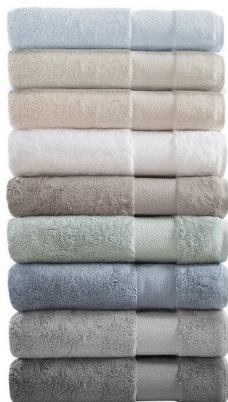
Madison Park Bath Towels from Wayfair $50.99