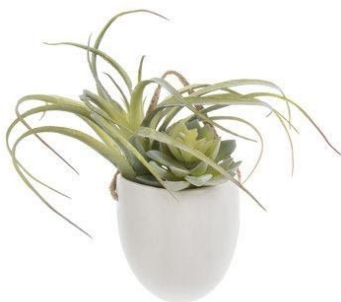
Air plants in white pot Hobby Lobby $21.99